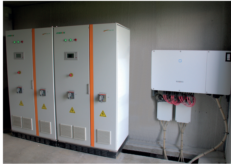
Sungrow's SG100K3 and the new SG110CX working side-by-side.

The modernization consisted of replacing the previous inverter with the new SG110CX string inverter. The SG110CX is a smart inverter which can be connected to the internet: monitoring and O&M have never be easier!